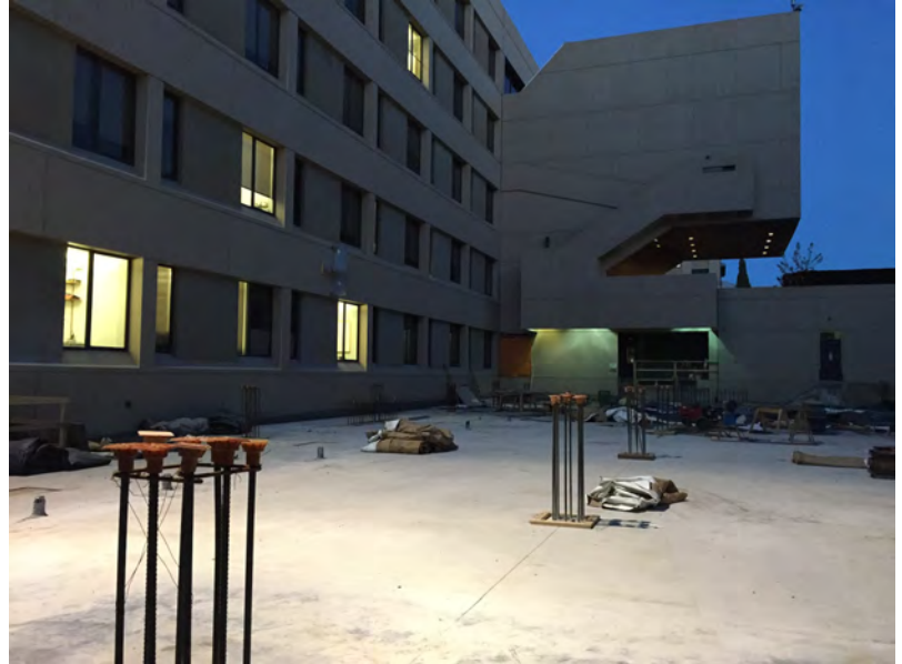
this level is the floor of the large clean room, that will have a green roof over it