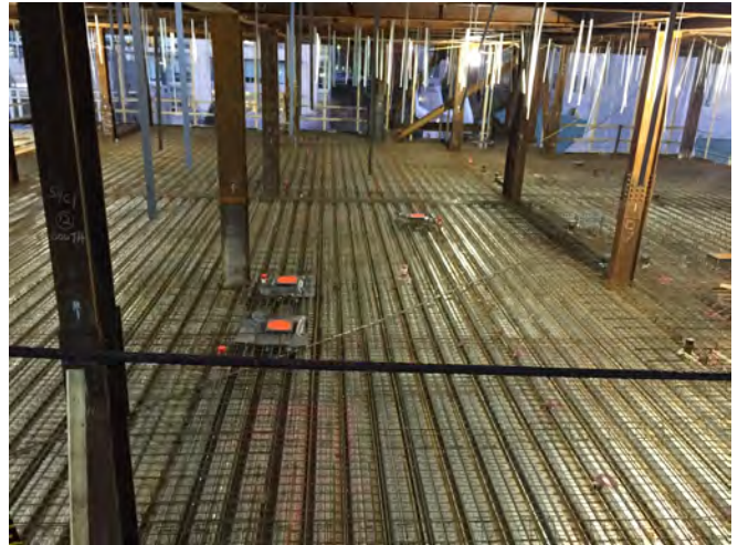
very dense reinforcing anticipating a 10" thick concrete slab