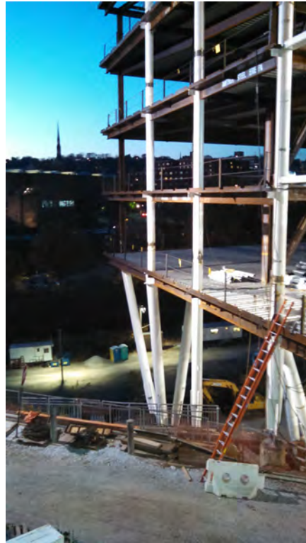
the white coating on the columns is intumescent fireproofing