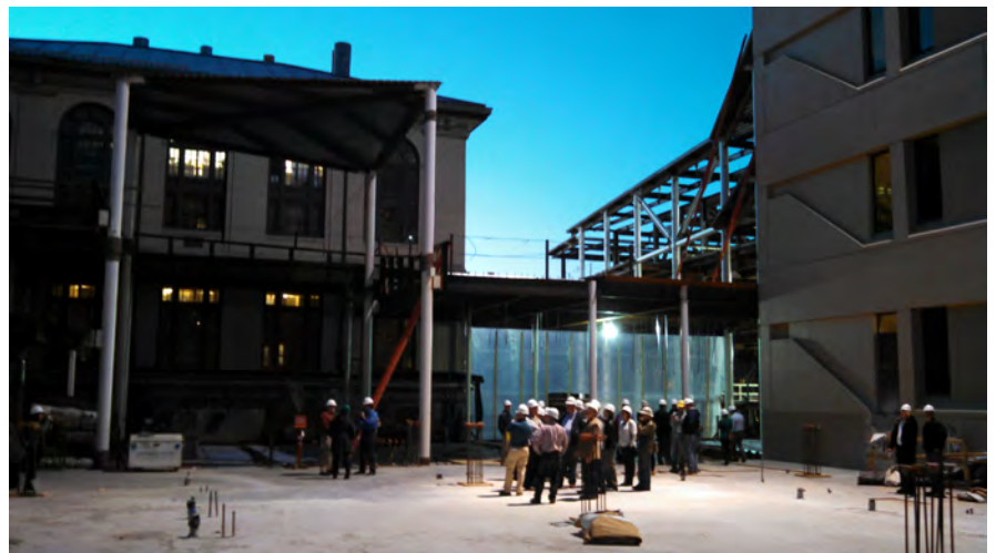
Scott Hall will actually squeeze between Wean Hall (right) and Hammerschlag Hall (left)