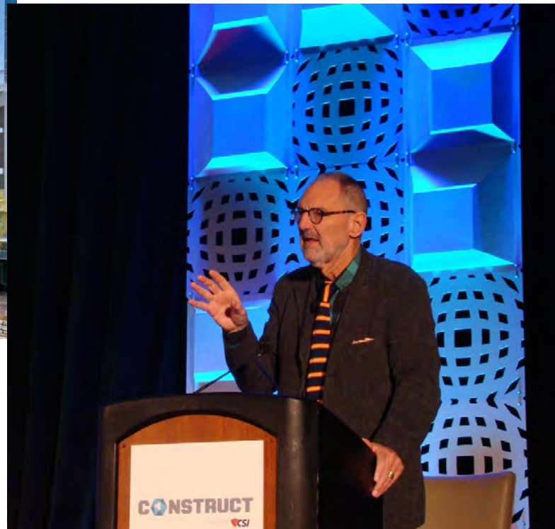
Keynote Speaker Thom Mayne of Morphosis Architects