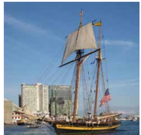
Tall ship in harbor September 10