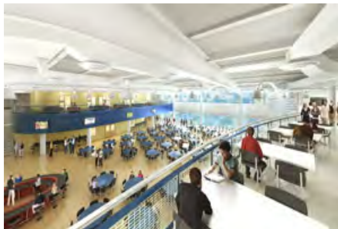
View of new Center Court.