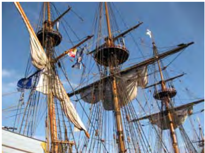
Tall ship in Harbor September 10