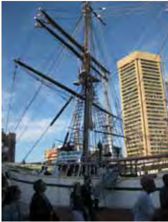
Tall ship in harbor September 10