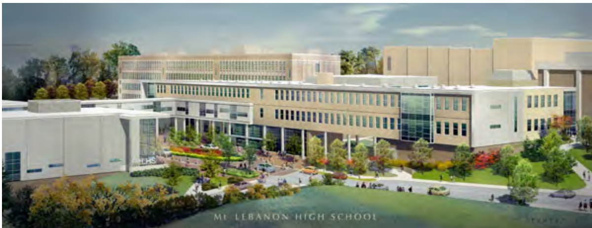
Aerial view from the south west with new fieldhouse and academic building in the foreground; existing historic academic building and auditorium and theatre buildings beyond.

Partnering with CFB is the Chicago based firm of OWP/P who led, in collaboration with CFB, the schematic and design development effort.