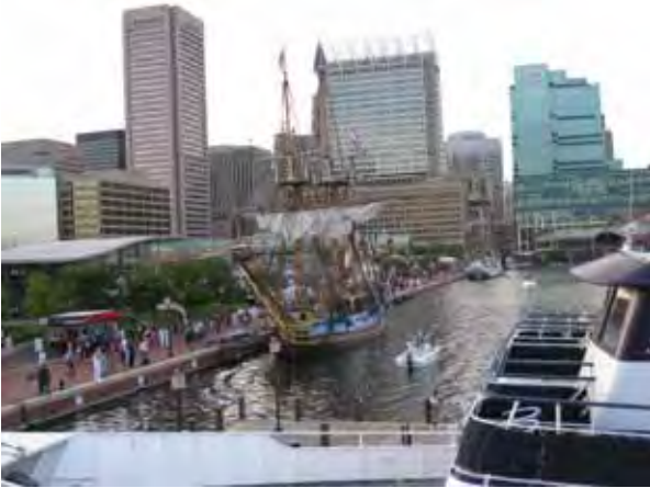
The harbor on the evening of September 10