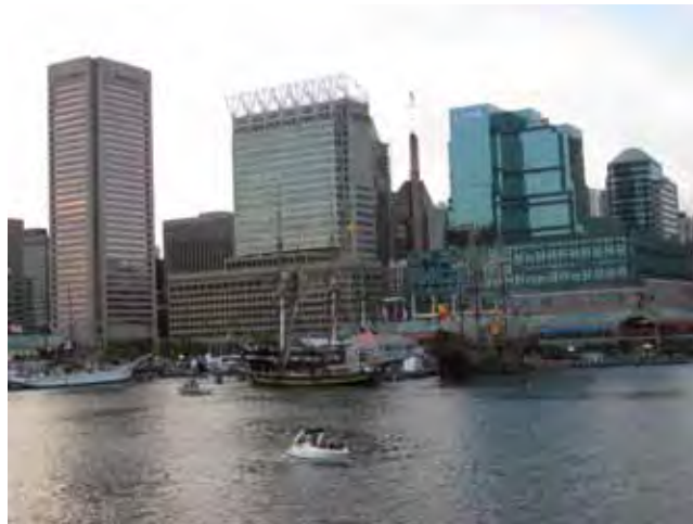
Harbor from dinner cruise ship September 10