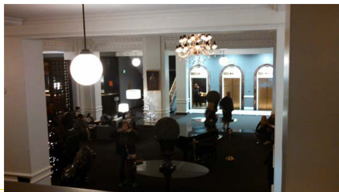
Lobby of Lord Baltimore Hotel