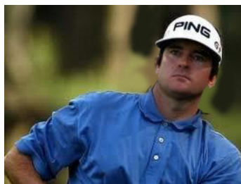
Masters Champ Bubba Watson