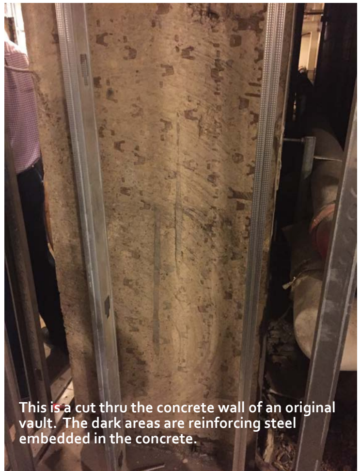
This is a cut thru the concrete wall of an original vault. The dark areas are reinforcing steel embedded in the concrete.