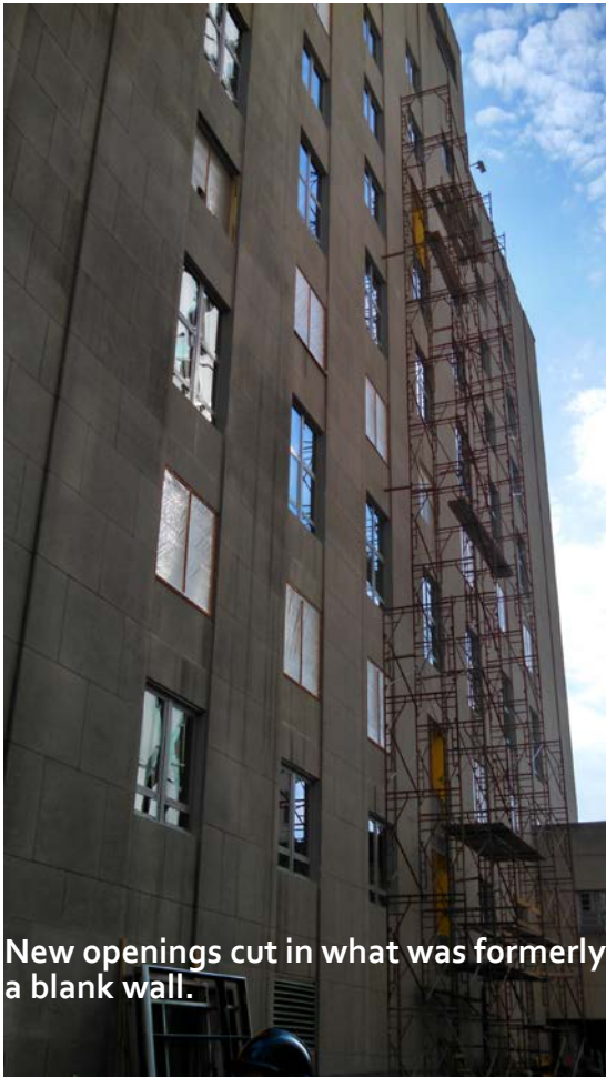
New openings cut in what was formerly a blank wall.