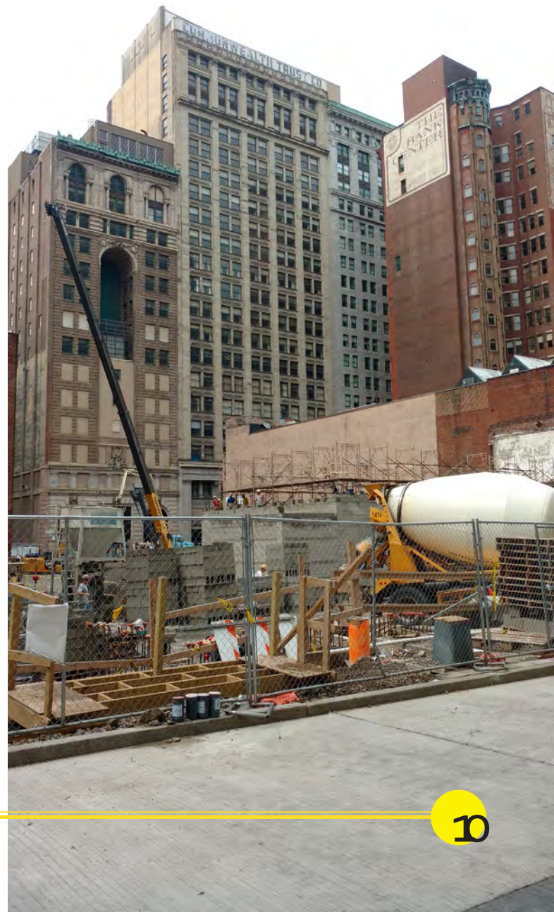
Right: Construction of the new Playhouse at Point Park University