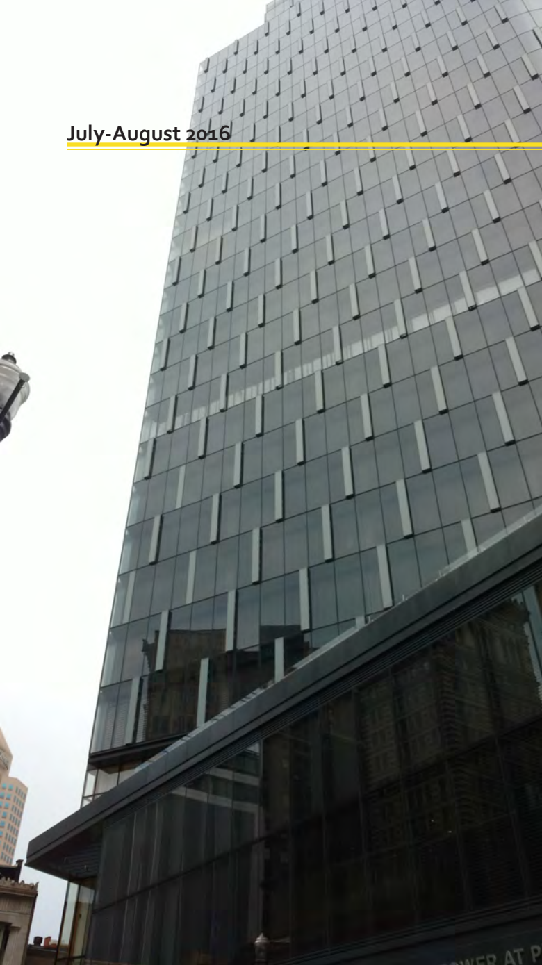
Left: The Pop-Out Windows of The Tower at PNC Plaza