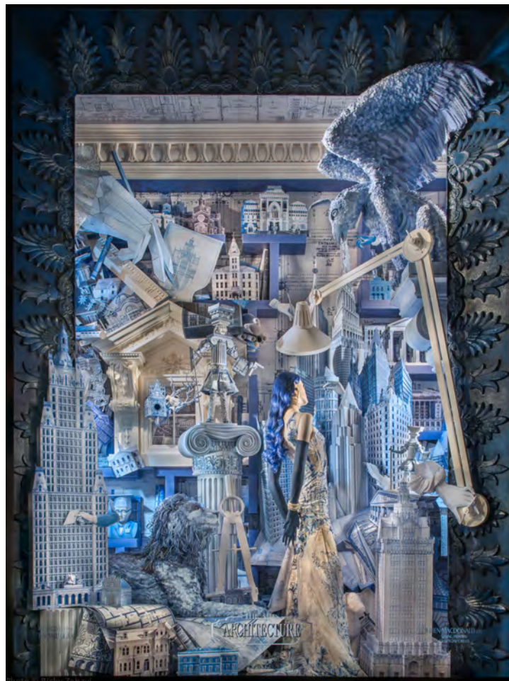
The Architecture window at Bergdorf Goodman

More than 100 artists and display artisans contributed in some way to the completion of the 2014 windows.